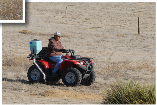
In an area still littered with plastic bags from the Phostoxin application, a few months later a County employee applies Rozol Prairie Dog Bait to every open burrow he can find within the buffer area surrounding and within the Haverfield Ranch complex.

Kansas Farm Bureau’s attorney and the anti-prairie dog entourage he had assembled. Not one word of this conduct was mentioned by the County. The hypocrisy of this was astounding: the County argued that it needed injunctive relief and yet days before the hearing their hired exterminator came onto the ranch complex and poisoned 500 acres of prairie dog colonies