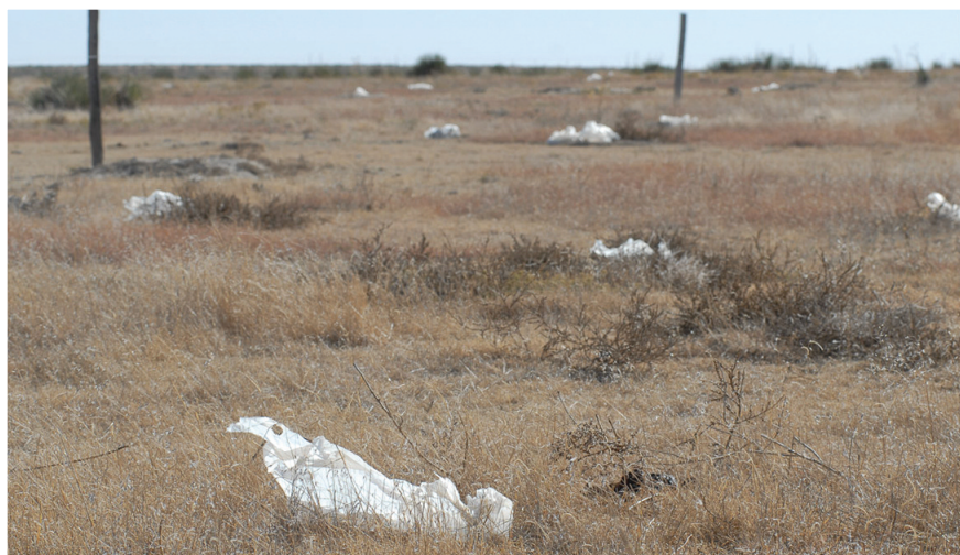
Plastic bags partially filled with sand cover prairie dog burrows across hundreds of acres, littering the landscape with plastic above ground and serving as burial markers for all that lived in the burrows at the time of the application of Phostoxin—a poisonous gas.

morning, I obtained a temporary restraining order prohibiting further use of the fumigant without a hearing on the legality of the use. Officials with the Kansas Department of Wildlife and Parks quickly disclaimed any interest in the fight and left the matter up to the County to defend.