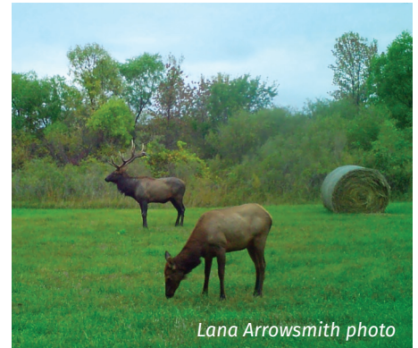
Elk, recently established along the Niobrara River, graze in the wet meadows and use the woodlands for security on the Hutton sanctuary.