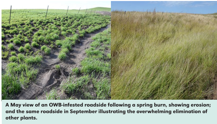
A May view of an OWB-infested roadside following a spring burn, showing erosion; and the same roadside in September illustrating the overwhelming elimination of other plants.

The seed sources of these beachheads for OWBs are seldom documented. It is generally speculated that it is from contaminated native grass seed coming from southern sources, from