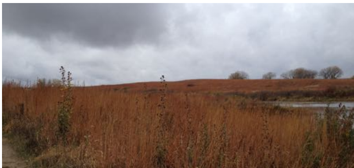
Early arrivers to the fall CGS Citizens Advisory Committee gathering got to “prairie peep” during the pre-meeting tour of Spring Creek Prairie.