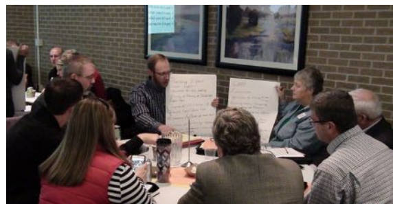
Each of the nine table groups listed and ranked top issues needing to be addressed to sustain and even increase Nebraska's success in beef production.