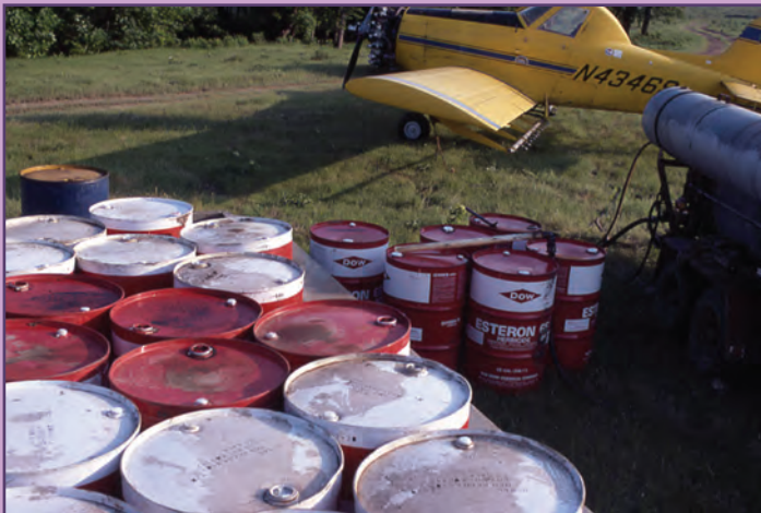
55-gallon barrels of herbicides fill a trailer and are on the ground awaiting aerial spraying of a rangeland in northern Osage County Oklahoma in the mid 1970s.

this plant community. The legumes are part of the reason why native rangelands do not have to be fertilized to remain productive.