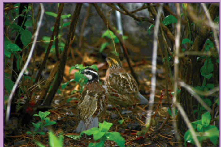
A pair of Bobwhites loaf in the protection of a shrub thicket at the Hutton Niobrara Ranch Wildlife Sanctuary, May 2015. The calls of quail and the songs of Western Meadowlarks could be heard throughout the day.

If a range landowner has a healthy population of Prairie-chickens on his land there are likely differing heights of native vegetation—and a complement of other grassland birds as well. If Northern Bobwhite coveys are present, the property likely has an array of habitat (including forbs and SHRUBS) and other birds. If Fritillary Butterflies are present, it is an indication of reasonably intact remnants of native prairie plant diversity.