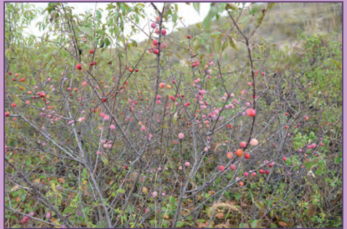
A wild plum thicket in the Nebraska Sandhills. Plum thickets are among the best "headquarters" habitats for Northern Bobwhites.

A fescue pasture is a grass monoculture that is essentially devoid of other life, from fireflies and butterflies to birds. Likewise, most of our native flora and fauna are eradicated from prairie rangelands that are repeatedly sprayed with broad-spectrum herbicides. Nowhere is this more apparent than on some of the large ranches in Osage County Oklahoma where herbicides have been repeatedly applied. One can no longer expect to find Prairie-chicken chicks feeding there on insects under a canopy of native forbs.