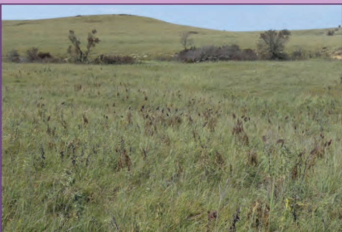
A typical native rangeland needlessly sprayed (September 2015 photo) in the Flint Hills west of Cottonwood Falls. Although the narrow strip of shrubs along the waterway and the lightly scattered forbs and sumac in the foreground were killed, they were likely beneficial to the health of the rangeland, of value for grazing and certainly for wildlife. Stewardship is a landowner's privilege, but should the public pay for ecologically destructive practices?

If you are wondering why the values mentioned above are overlooked and why native shrubs and forbs are regarded as brush and weeds, examine the combined contribution of ecologically-illiterate agronomists in agencies and the vested interests involved in sales of herbicides, and even academics funded and focused strictly on the efficacy of herbicides in field studies. The measure of success is killing plants.