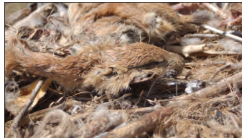
The remains of prairie dogs in this nest in Oklahoma attest to the importance of this prey. The hawk pictured above is eating a ground squirrel.