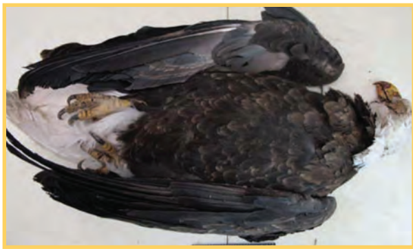
One of two Bald Eagles found that succumbed to chlorophacinone poisoning in Nebraska.

which are provided by industry to finance field studies on the efficacy of chemicals designed to kill insects or other pests, or “weeds and brush” (everything that is not grass in pastures and on roadsides). This template has been a pathway to registration used many times in the past. If all goes according to plan, this partnership gives pesticide/herbicide manufacturers something akin to a university’s “good housekeeping seal of approval,” and sometimes they acquire the principal investigator as a consultant to help advocate either officially or unofficially for the product.