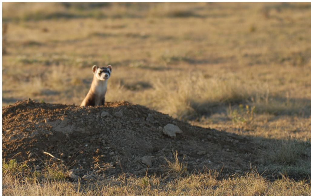
Following release, a captive-raised Black-footed Ferret surveys its new home from atop a prairie dog mound on property owned by Maxine Blank..

Although the Logan County Commissioners and allied politicians have railed that prairie dogs are emigrating from the properties and boundary controls have not been successful, the data maintained by the field staff of USDA’s Animal and Plant Health Inspection Service’s Wildlife Services division (APHIS-WS) demonstrate the opposite. As an illustration of this fact, 105,740 prairie dog burrows were treated with toxicants on neighboring properties in the 2009-2010 season. The number of active burrows dramatically declined each year and by 2012-2013 the reduced number treated totaled 40,211. Likewise, the number of prairie dogs killed with firearms dropped from 8033 in 2011 to 5073 in 2013. Following an Audubon of