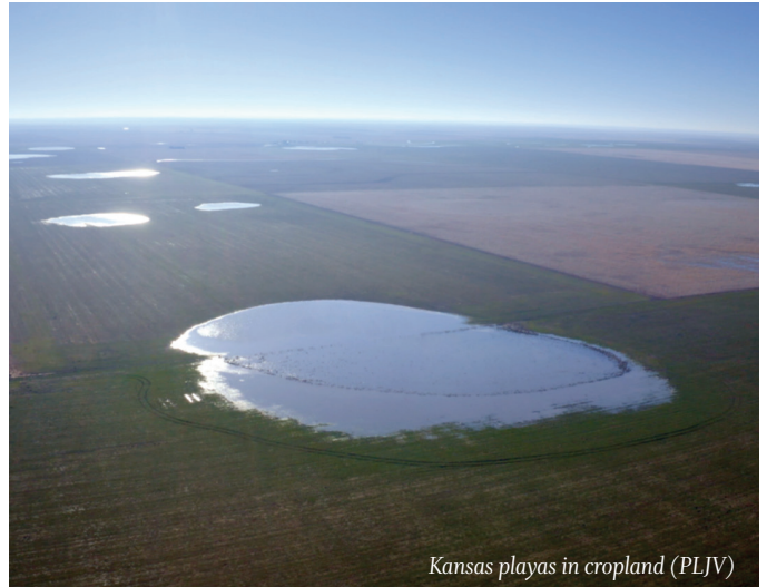
Kansas playas in cropland (PLJV)

healthy or unaltered playas is of higher quality than that going through other pathways. This happens in two ways: first, as rainfall and runoff travel toward the playa, the surrounding grasses trap sediments, which can carry contaminants into the playa; then, as the water moves through the clay floor of the playa, a second ‘cleaning’ process occurs as the soils beneath the playa remove nitrates and other dissolved contaminants.