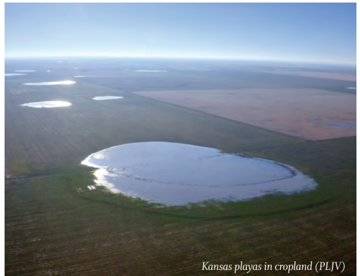
Kansas playas in cropland (PLJV)

healthy or unaltered playas is of higher quality than that going through other pathways. This happens in two ways: first, as rainfall and runoff travel toward the playa, the surrounding grasses trap sediments, which can carry contaminants into the playa; then, as the water moves through the clay floor of the playa, a second ‘cleaning’ process occurs as the soils beneath the playa remove nitrates and other dissolved contaminants.