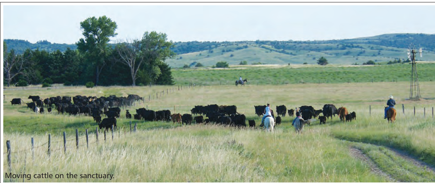
Moving cattle on the sanctuary.

Our plan is to transfer 100 prairie dogs from the Fort Niobrara National Wildlife Refuge east of Valentine. The US Fish and Wildlife Service has been a conservation partner in this proposal, and the Nebraska Game and Parks Commission has provided a "Scientific and Educational Permit" which will allow Audubon to establish the new colony. From the beginning we planned to build a "prairie-dog fence" similar to the one we constructed in western Kansas. It discourages dispersal from the site used for the experimental reintroduction of Black-footed Ferrets, and the fence is an appropriate condition of the permit. Two years ago we established a vegetative buffer consisting of tall grasses and forbs, including Maximilian Sunflower, and it