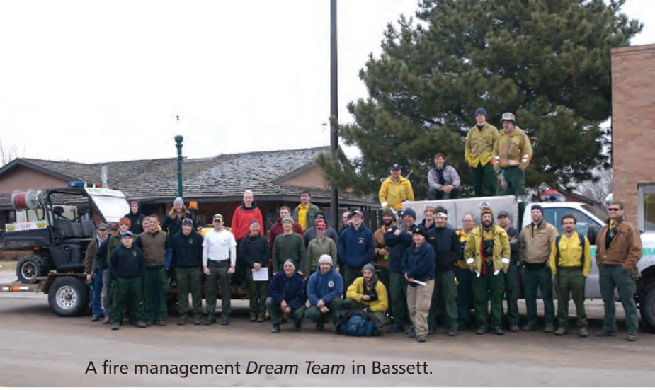
A fire management Dream Team in Bassett.

It is conceivable that tens of thousands of birds are drowned in tanks in the Great Plains each year. With that experience in mind, I took this concern to the U.S.D.A. State Technical Committee meeting in Kansas – and NRCS adopted the practice of requiring wildlife escape ramps in tanks that are cost-shared with EQIP funding.